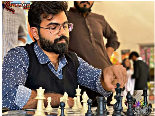
Students Sports Week