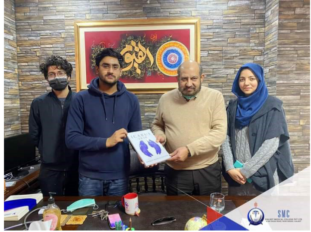
Sialians Literary Society launched college magazine "ICARUS 2020"